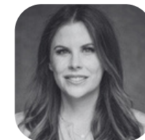
Carmen Page Raha International School UNITED ARAB EMIRATES